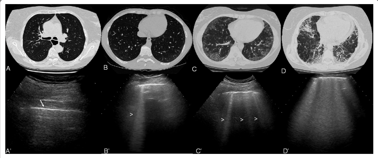
Figure 1 HRCT features of interstitial pulmonary fibrosis. A. Normal aspect of the lung. B. Mild. C. Moderate. D. Severe. A'. US examination of healthy interlobular septa at lung surface level. Note as the pleura is a linear and regular hyperechoic band (arrow). B'-D'. US examinations showing different scores of fibrotic pulmonary involvement: B'. Mild. C'. Moderate. D'. Severe.