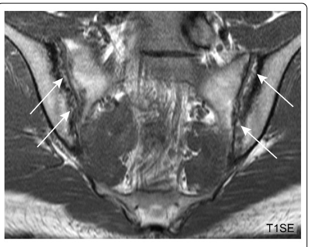
Figure 3 Backfill, baseline MRI (T1SE sequence) . HLA B27 positive, 25-year-old male AS patient. The T1SE sequence of the SIJ displays extended erosion of the iliac joint portion on both sides. The excavated iliac bone is replaced by tissue showing MR signal intensity similar to or higher than normal bone marrow (arrows). HLA-B27, human leucocyte antigen B27; MRI, magnetic resonance imaging; T1SE, T1-weighted spin echo sequence.

were assessed per four iliac and sacral joint surfaces irrespective of the number of SIJ slices affected.