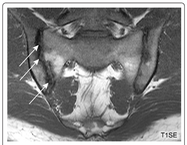
Figure 2 Extended erosion (T1SE sequence) . HLA B27 positive, 28-year-old male AS patient with inflammatory back pain for five years. The right ilium shows erosion which extends across the entire joint surface (arrows). HLA-B27, human leucocyte antigen B27; T1SE, T1-weighted spin echo sequence.

teleconference sessions using SIJ MRI scans of AS patients not involved in this study population. MR images of the SIJ were assessed according to the standardized methodology outlined in an online training module [13]. This standardizes the assessment of consecutive semicoronal slices through the SIJ from anterior to posterior outlining which are the first anterior and last posterior slices that are scored according to anatomical landmarks. We recorded erosions, bone marrow edema (BME) and fat infiltration (FI) in each SIJ quadrant on each semicoronal slice in a customized online data entry module described previously [6]. EE and BF