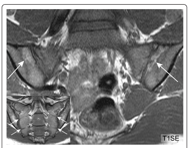
Figure 5 Open epiphyseal growth plate mimicking backfill ( T1SE sequence ). 18-year-old male healthy control. Irregularly shaped increased signal alteration on T1SE sequence (arrows) compatible with fat infiltration of the anterior predominantly iliac joint portion. Insert: The sacral vertebrae are not yet completely fused (arrows). T1SE, T1-weighted spin echo sequence.

Among the 30 AS patients, the percentage concordance for the detection of erosions in the iliac joint portion was high (80.0%; positive/negative concordance - 75.0% and 5.0%, respectively) and comparable with the percentage concordance for BME (79.7%; positive/negative concordance - 60.3% and 19.4%, respectively) (Table 2). The percentage concordance in the sacral joint portion, which