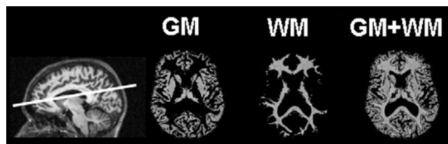
Example of segmented axial MTR map (level indicated at the sagittal image). Visualized are the compartments grey matter (GM), white matter (WM) and grey and white matter (GM + WM). Signal intensities represent MTR values. MTR, magnetization transfer ratio.

explain their neuropsychiatric symptoms. Therefore, in all patients diffuse involvement of the CNS was thought to underlie the neuropsychiatric manifestations. We observed lower values for mean MTR and peak location in grey and white matter in patients positive for aCLs and Lac.