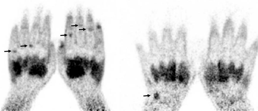
Fig. 1 ^{11}\text{C} -(R)-PK11195 PET scan. Coronal ^{11}\text{C} -(R)-PK11195 PET scans of two RA patients without apparent synovitis. Enhanced uptake of the macrophage-targeting PET tracer ^{11}\text{C} -(R)-PK11195 is visible as black hotspots (arrows). Interosseus muscles and nailbeds show normal background uptake

This novel study demonstrated enhanced uptake of the macrophage PET tracer ^{11}\text{C} -(R)-PK11195 in the hands and/or wrists of almost one-half of a cohort of early RA patients in MDA after intensive combined DMARD therapy. Furthermore, significantly higher cumulative PET scores were observed in the subset of patients that flared in hands/wrists compared with those patients without a flare. These results support our previous results with ^{11}\text{C} -(R)-PK11195 PET in treated RA patients with longstanding disease [15], and suggest that subclinical macrophage activity can be present in treated RA patients with clinically quiescent disease, regardless of disease duration. Because the presence of subclinical disease activity and frequent flares have negative impact on clinical outcome